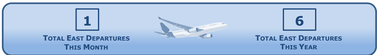
East Departures Yearly Comparison

The number of East Departures may vary from month to month due to weather, air traffic volume, and/or operational factors.