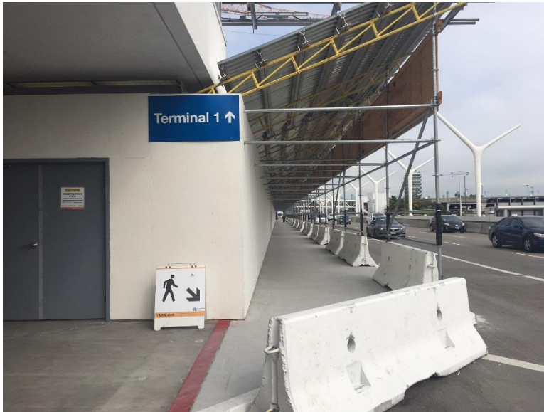
Departures Level, Curbside (between Terminals 1 & 2) Canopy Construction