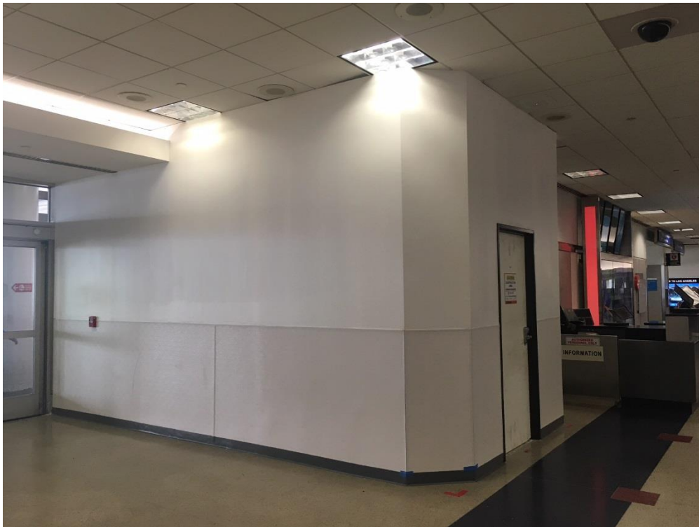
Terminal 4, Arrivals Level