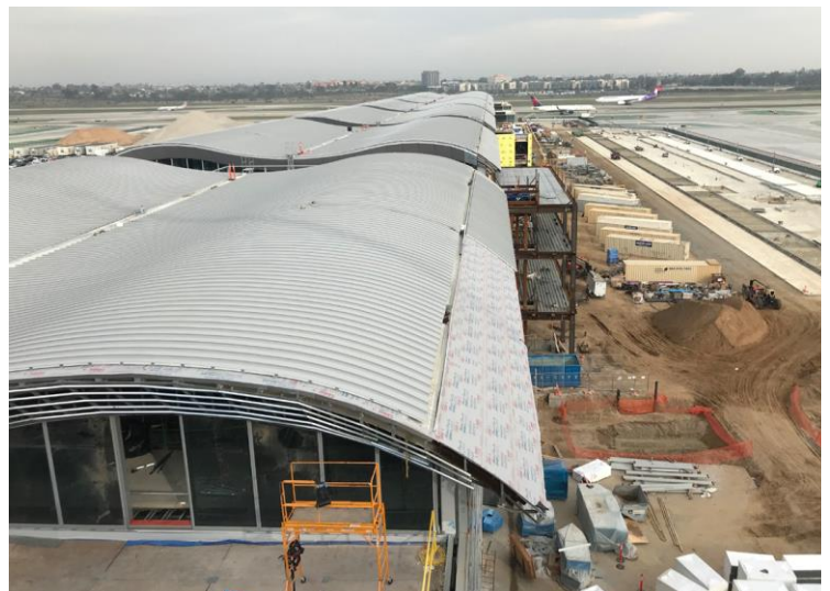
Midfield Satellite Concourse