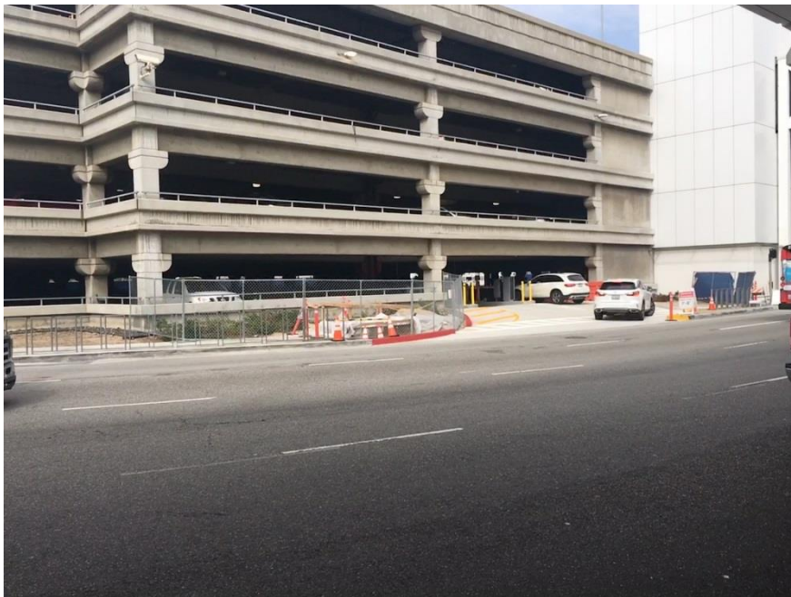
Parking Structure 4, CTA Southwest Corner