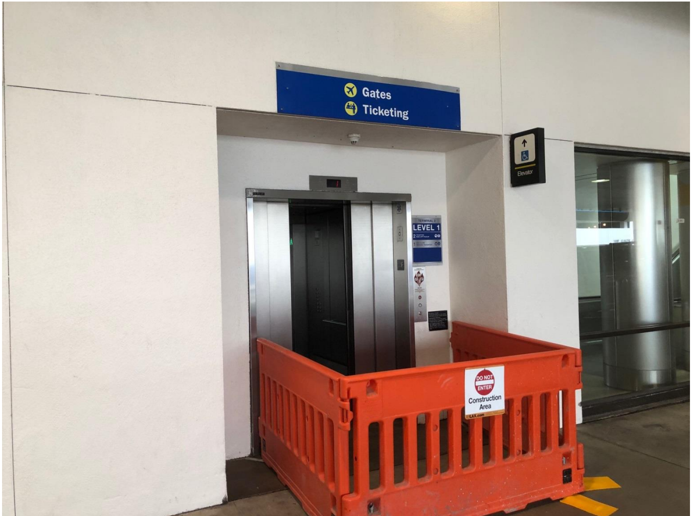
Terminal 2: Escalator 10 Closed (Along with Escalator 2 at Terminal 2 and Escalator 1 at Terminal 3)