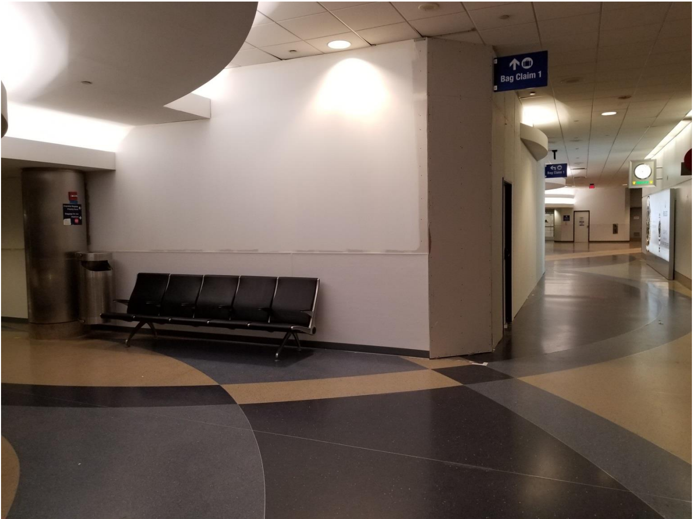
Terminal 4, Arrivals Level